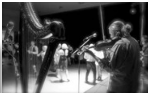
The Cosmic Ceilidh Band