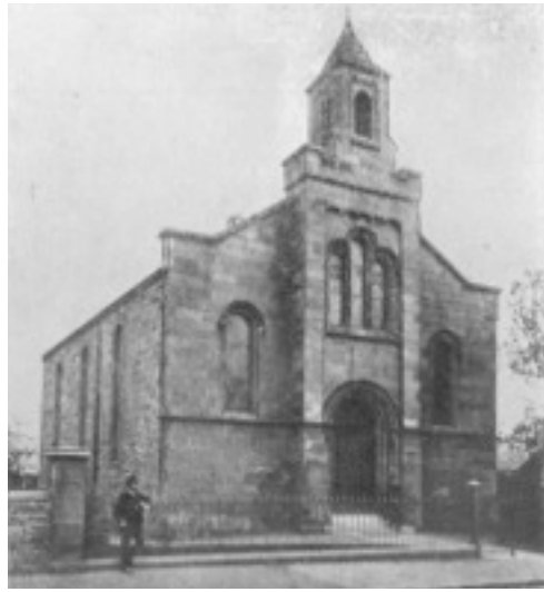
Marchtown Church, Strathbungo, 1880s

The photograph below comes from a rare book, Strathbungo and its Kirk , published for the church's centenary in 1933. By chance two copies recently surfaced, providing further insight into Strathbungo's history.