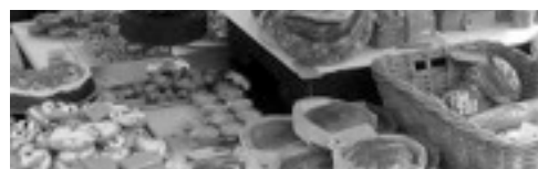
New Victoria Gardens spread

Bakery47 is just starting out, and it has no storefront as of yet. Their substantial, wholegrain breads and artisan cakes and tarts