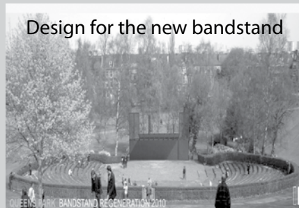
Design for the new bandstand

In 1930, the old bandstand was replaced by a larger, wooden building with a paved, terraced, semi-circular seating area (shown above). That bandstand burned down in 1996, but the remains of the seating were still a sad sight up until