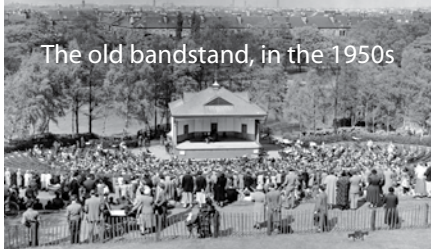
The old bandstand, in the 1950s