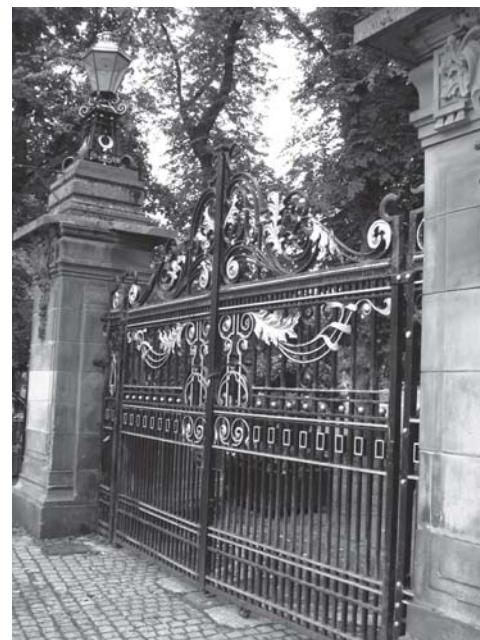
After: Gates at Victoria Road entrance.