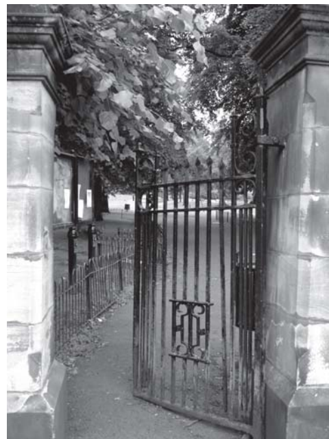
Before: Room for improvement?

Don't agree? Got bigger and better ideas? Come along to the AGM and put forward your suggestion, or vote on one of the alternatives; returning the money or giving it to a different organisation in the area.