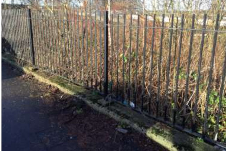
14/08/2018 10:00 AM - 10:00 AM - 10:00 AM - 10:00 AM